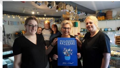
Spooncake in Loddon