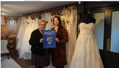
Glamorous Gowns in Wymondham.

I visited two businesses for this event: